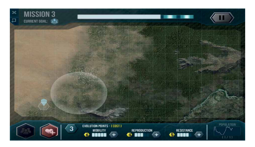
Figure 10.1: Command console of Evolving Planet. A region of the planet is portrayed in the map, including geographical and environmental features. Population is depicted as coloured white dots. The player can indirectly interact with them by spending Evolution Points on their modifiable attribute (in this scenario: mobility, reproduction rate, and resistance) or temporarily boosting some of them. This user interface is rather similar to the ones used in agent based modelling.