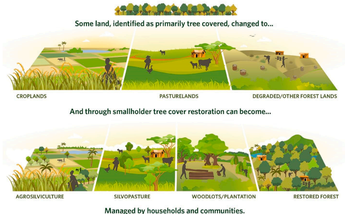
Fig. 1. A depiction of how forestlands that underwent land use change to become croplands, pasturelands, or degraded forestlands can incorporate smallholder tree cover restoration to become agrosilviculture, silvopasture, woodlots or plantations, or restored forests.

To estimate area and population totals on low-cost restorable lands in crops, pasture, or degraded forest, we intersect the Busch-Erbaugh data with data on the extent of croplands (Fritz et al., 2015) and pasturelands (Ramankutty et al., 2008), which are both 1-km resolution resampled to ~5.5 km 2 grid cells. We avoid double-counting by excluding cropland from the resampled pastureland data, which are less recent and have lower resolution than the cropland data. We identify degraded forestland as areas in the Busch-Erbaugh data that are potentially restorable and are not used for crops or pasture, noting that our definition of degraded forestland excludes grid cells that lost forest cover prior to 2000, i.e., forest areas that were already degraded below 30 % forest cover by 2000. While we refer to this area as degraded forestland, we recognize that it might include smaller mosaics of land uses (e.g., small habitations, or small tracts of cropland, pastureland, recovering forests, or shifting cultivation) in addition to degraded forestland. Within countries, we calculate zonal statistics for the areas