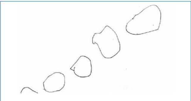
FIG. 5 - Drawings made by a 3-year-old child. They represent beautiful teeth (A), and ugly teeth (B).