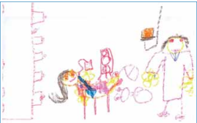
FIG. 3 - Representative drawing of the dental appointment, made by a 6-year-old child.