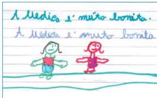
FIG. 9 - Drawings made by children of 9 and 6 years of age, respectively, offered as a gift to the paediatric clinician.

themselves whether their perceptions are true. Through the drawing the representation is logic, passing from the perception and drawing of isolated teeth, to the representation of both arches with closed teeth, similarly to an intraoral photo in maximum intercuspitation (Fig. 7, 8).