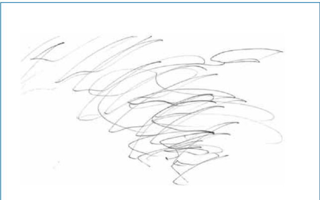
FIG. 4 - Drawings made by a 21-month-old child. They represent beautiful teeth (A), and ugly teeth (B).