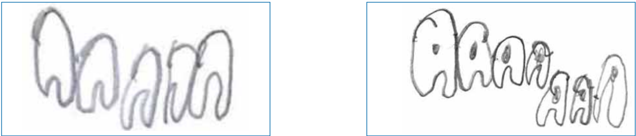
FIG. 6 - Drawings made by a 6-year-old child. They represent beautiful teeth (A), and ugly teeth (B).

In the concrete operations period (7 to 11 years) children have the ability to reverse the thinking and use fundamental logic. They start questioning