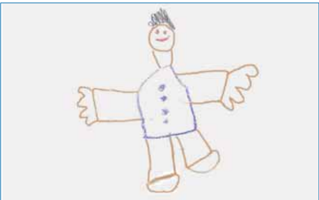
FIG. 2 - Representative drawing of a person made by a 5-year-old child.

According to the developmental stages of Piaget, the images of “beautiful teeth” and “ugly teeth” were obtained depending on the aesthetic perception of the child: sensorimotor period (0-2 years) (Fig. 4); pre-operative period (2 to 7 years) (Fig. 5, 6); concrete