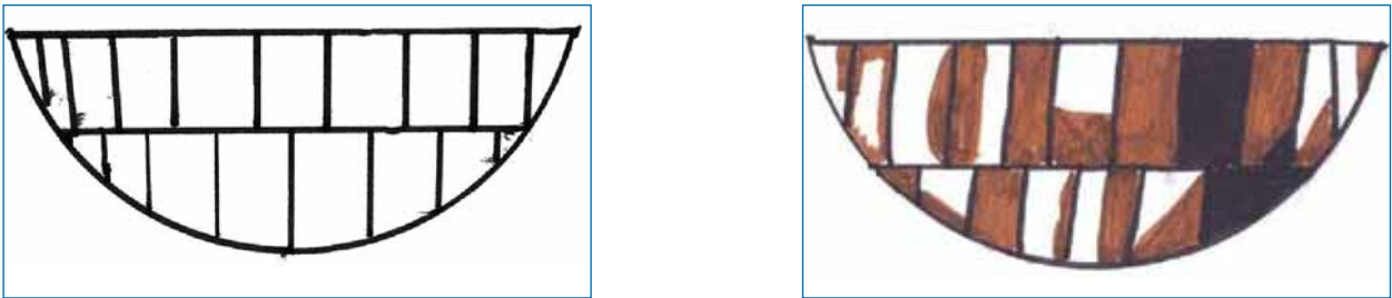
FIG. 7 - Drawing made by a 9-year-old child. They represent beautiful teeth (A), and ugly teeth (B).