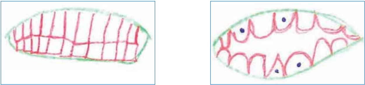
FIG. 8 - Drawing made by an 11-year-old child. They represent beautiful teeth (A), and ugly teeth (B).