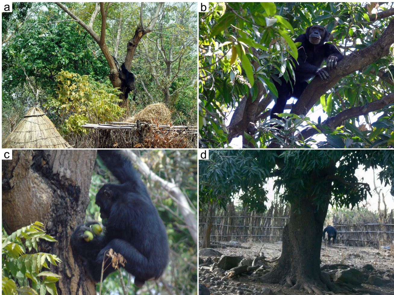
Fig. 2a–d Crop feeding by chimpanzees in Nandoumary village, Dindefelo. a–c Adult male carrying mango fruits next to a house. b Adult male on a mango tree located in the village. d Adult male leaving the compound of a house after accessing mango trees