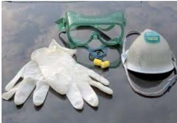
[Various elements of an appropriate Personal Protective Equipment (PPE).]

Safety with regard to handling products used in painting, drawing and printmaking as a work system is widely dealt with in an enormous variety of legal texts, handbooks, offprints, studies, guide books, etc. However, all the existing regulations and information make no sense if the individual attitude, primarily, and the collective one in the studio, secondly, are not adopted as rules of conduct.