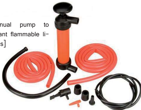
[Manual pump to decant flammable liquids]