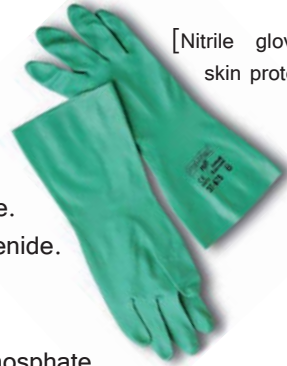
[Nitrile gloves for skin protection]