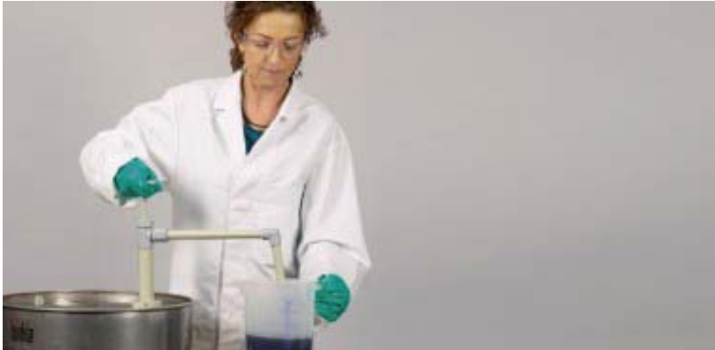
[Pumping system liquids decant.]

As far as respiratory protection is concerned, it is advisable to consider the levels of exposure in order to decide whether protection is absolutely necessary to use or it is simply a precautionary measure. For example, for handling iron trichloride, the appropriate protection is a P2 type of particle filter. An FFP2 type of filtering face piece or a P2 filter for a face mask can be used. Carbon filters do not filter nitric acid and nitrogen oxides properly.