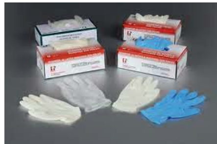
[Latex gloves for skin protection]