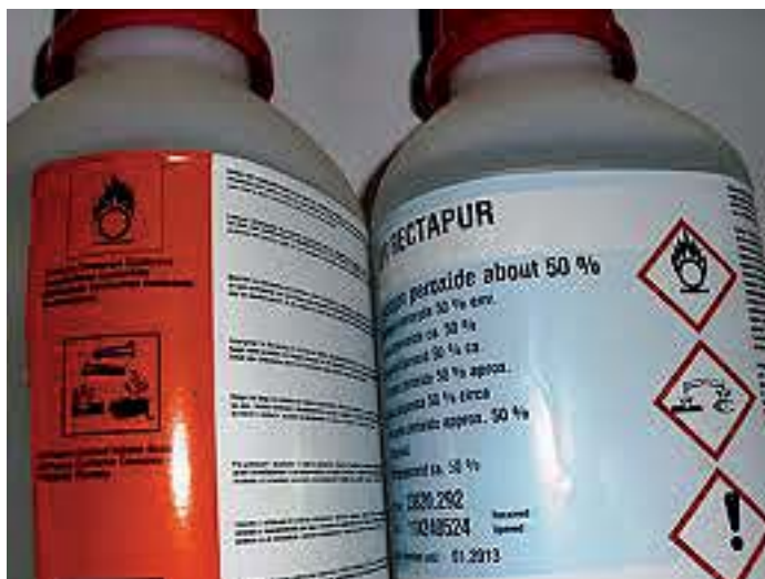
[Proper storage of solvents by chemical species with good visibility of product labeling]

The presence of flammable materials (paper, cardboard, cloths, resins) and sources of combustion (gas or electric fires, the electrical system itself or accumulated static electricity) in the painting, drawing and printmaking studio, make it necessary for the users to maximize precautions when handling and storing regularly used flammable chemical products such as solvents and the products which contain them. Thus, the fire or explosion hazard will be avoided or minimized.