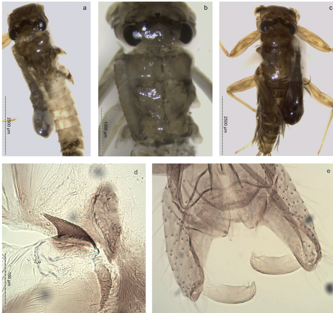
Fig. 1.— Symbiocladius wygodzinskyi Roback, 1965 parasitic on Meridialaris sp. (Ephemeroptera; Leptophlebiidae) in Peru. a) River Chusgón (larvae in pupation). b) Larvae from River Anchapillay. c) Male pupae from River Anchapillay. d) Pupal thoracic horn. e) Male hypopygia.

Fig. 1.— Symbiocladius wygodzinskyi Roback, 1965, ectoparásito de Meridialaris sp. (Ephemeroptera, Leptophlebiidae) en Perú. a) Río Chusgón (larva pupando). b) Larva del río Anchapillay. c) Pupa macho del río Anchapillay. d) Cuerno torácico de la pupa. e) Hipopigio del macho