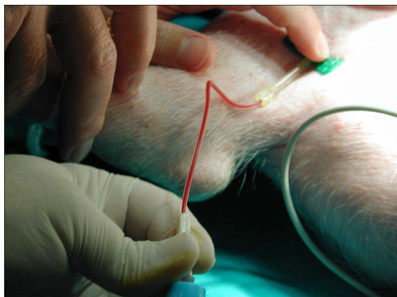
Figure 5. PRP, obtained via the femoral artery (located previously by the attending veterinarian), is used and collected in 5 ml citrate tubes (4 tubes/ animal).

PRP was routinely obtained by femoral bleeding, and no incidents were reported (Fig. 5). Bone marrow was collected through sternum trephination (Fig. 6). Some complications appeared in pig number 4, being necessary to