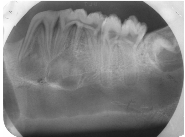
Figure 2. Radiography of the mandible of a five-month old pig.

up by the dental germs in an age-dependent fashion, which results in reduced available space for material implantation. The coincidence of these anatomical structures with the extension of the working area limits the interpretation of the results. For this reason, young animals (approximately 3 months old) are recommended for experimental studies: at this age, they present a more distended space between the dental germs and the inferior rim of the mandible, as well as a longer distance between the anatomical orifices (Fig. 2). Depending on the number of orifices to implant