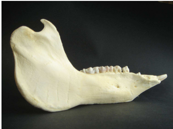
Figure 1. Lateral view of the mandible of a five-month old pig

All the animals used in the study received the analgesic and antibiotic protocols established by the rules and regulations of the animal services in which the animals were maintained. All of them ate normally between 1 and 3 hours after surgery and gained weight adequately. One of them died a few hours later as a result of postoperative complications. Another presented a small abscess, which was debrided (Fig. 1).