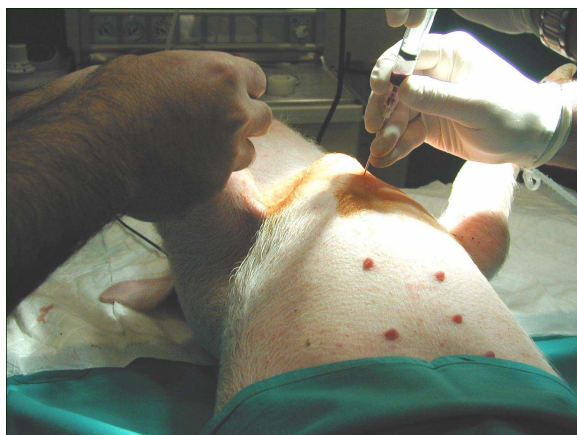
Figure 6. Bone marrow is obtained by sternum puncture, which is a less traumatic procedure than puncture of the crista iliaca. 3 to 5 ml of bone marrow are obtained per puncture. Only one of the experimental subjects presented some difficulty for collection of the bone marrow; 3 punctures were required in this case.

make three punctures. However, the animal did not show additional post-surgery complications. In conclusion the hybrid pig constitutes a convenient experimental model in dentistry, with very few limitations for the applications herein assayed. Moreover, the external surgical approach technique turned out to be useful to do perforations in the mandible in order to place the regeneration material.