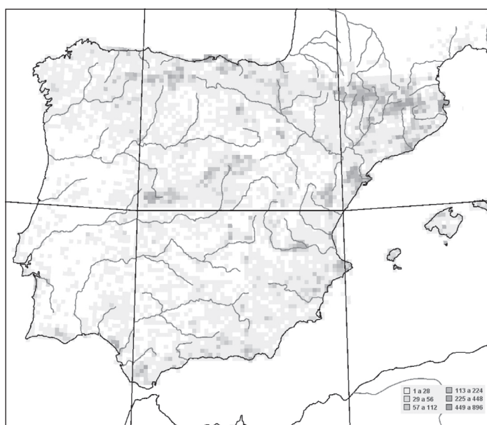
Figure 2. Geographic distribution of the relevés computerized in SIVIM. Color intensity indicates the number of relevés in each cell of the UTM 10 \times 10 km grid.

project goals by the end of 2012 is to reach 125,000 Ibero-Macaronesian vegetation relevés which would represent two thirds of the lower estimation of accessible data in the territory covered by the database. During its first year of operation, the SIVIM web has received 22,000 visits for consulting or requesting data.