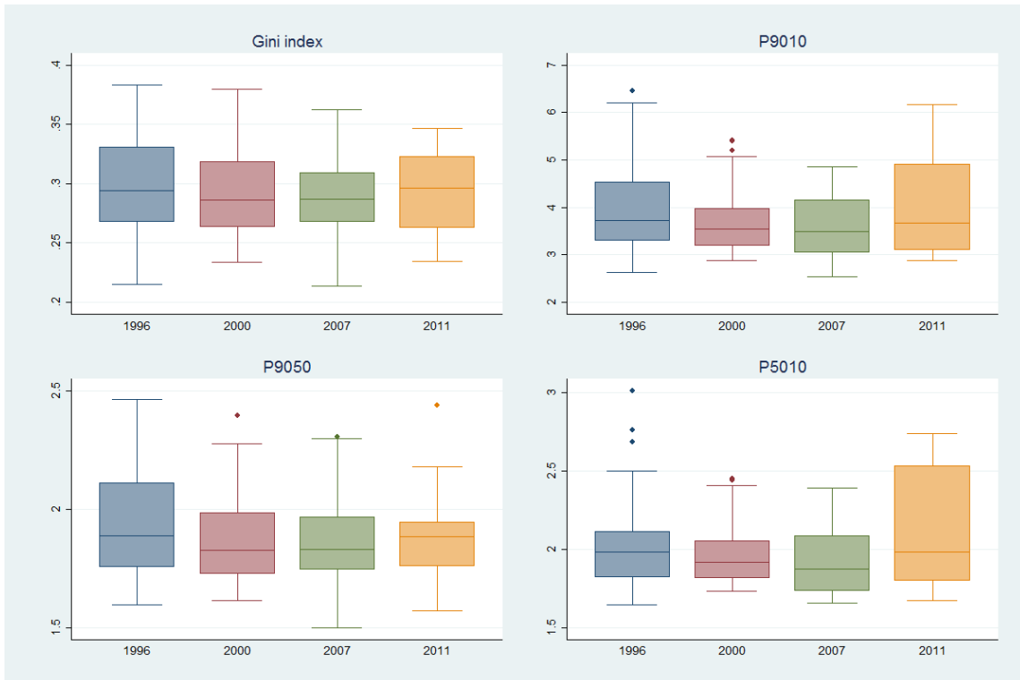
Figure 2. Evolution of inequality in European regions: several inequality measures

Note: Own calculations from ECHP and EU-SILC micro data. As 2011 data for Belgian and Irish regions is not currently available, we have used the value of the Gini Index for 2010 as a reference year.